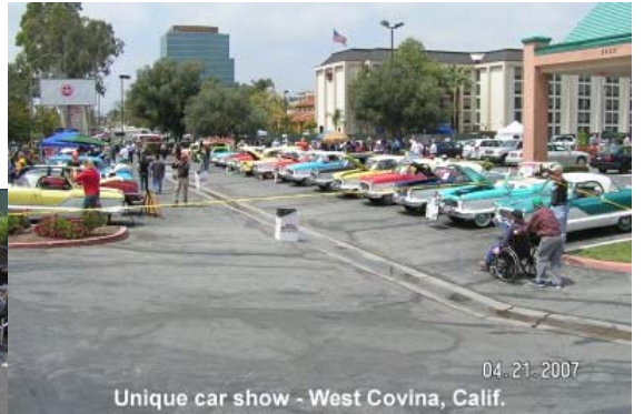
Unique car show - West Covina, Calif. 04-21-2007