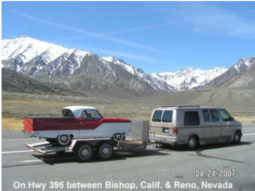
On Hwy 395 between Bishop, Calif. & Reno, Nevada 04-24-2007